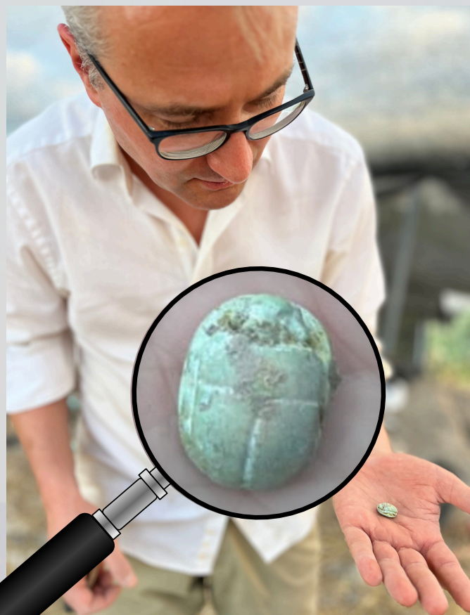
12th Century BCE Egyptian Scarab

Tel Shaddud was first settled in the Early Bronze IB (EB IB) (ca. 3350–3000 BCE), when a relatively large and complex village was founded on and can be seen now at the foot of the Tel. Sometime during the Middle Bronze Age (ca. 1950–1600 BCE) the settlement shrunk in size to the confines of the Tel and was probably fortified. The areas to the foot of the Tel began to be used as a burial ground for a lengthy period beginning in the Middle Bronze I (MB I) and then again in the Late Bronze IIB –Iron IIA.